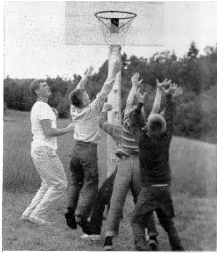
Basketball is one of the favorite sports among the boys at Hidden Lake Lodge.