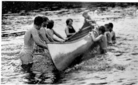
Swimming, canoeing, and boating are taught by camp councillors in Lodge's private lake.