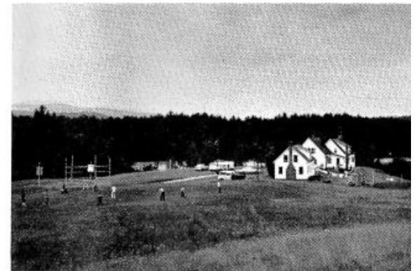
Nestled amid the hills and fir trees near Lisbon, Hidden Lake Lodge gives boys opportunity to enjoy the beauty of North Country.