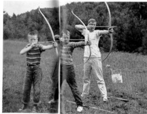
For budding William Tells, archery instruction is always available.